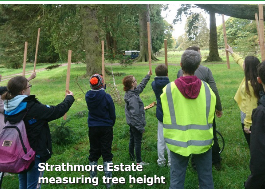
Strathmore Estate measuring tree height