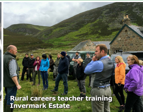
Rural careers teacher training Invermark Estate