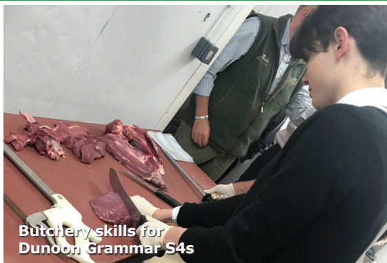
Butchery skills for Dunoon Grammar S4s